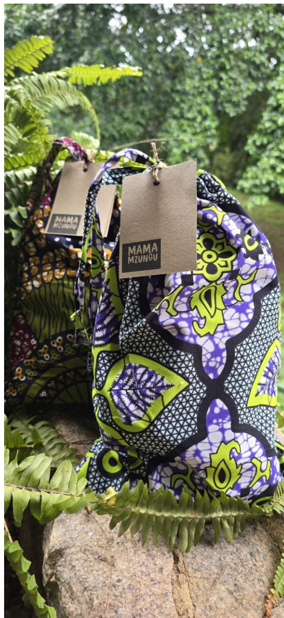
Finished Waridi kit